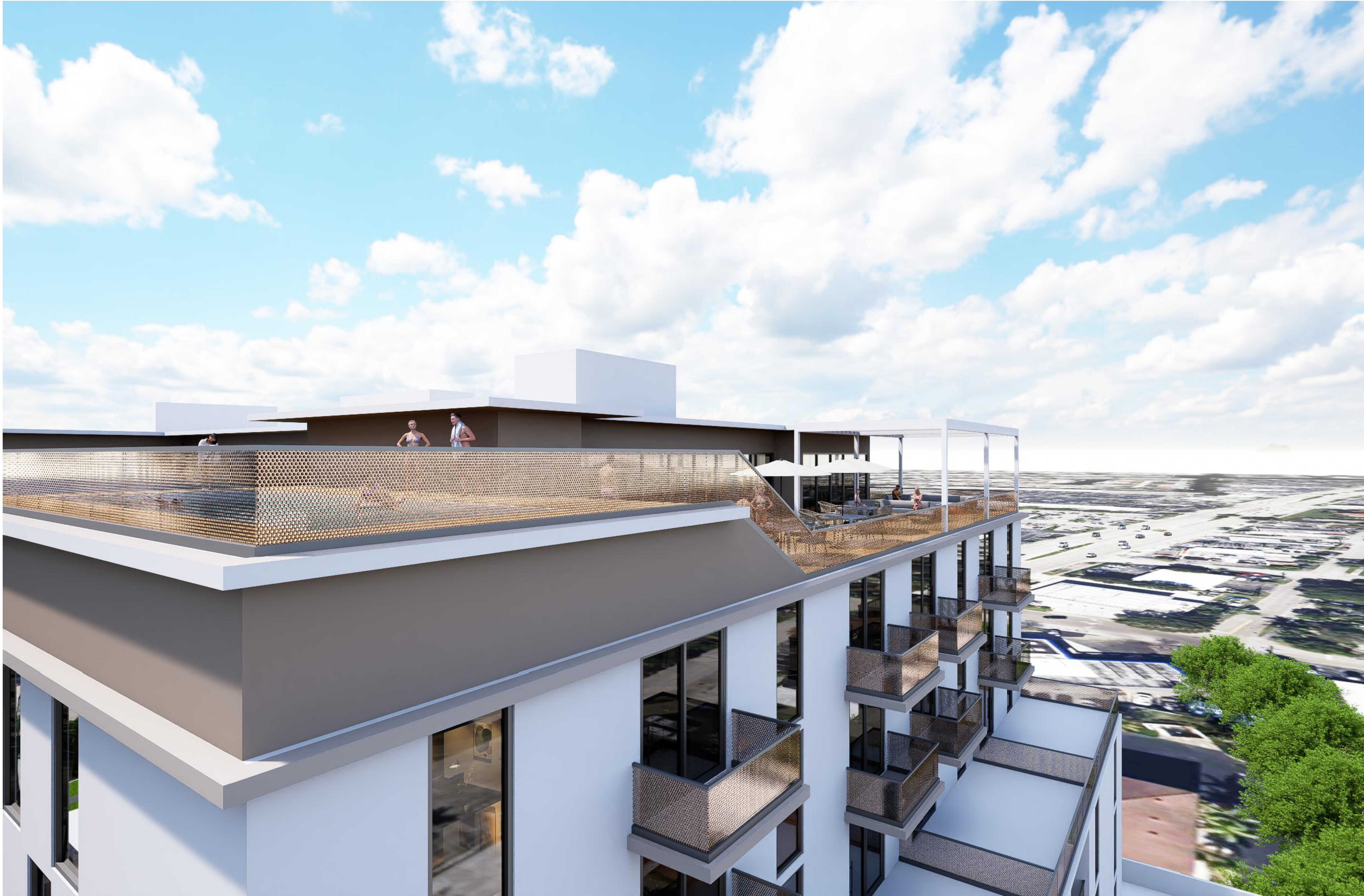
ZOOM-IN VIEW OF THE ROOFTOP TERRACE